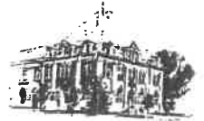
Exhibit C Executive Session Minutes Portions No Longer Confidential